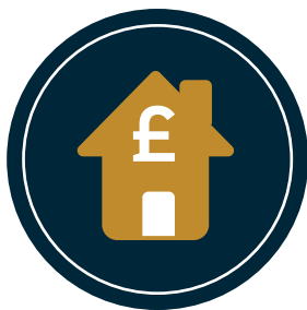
Estate agent fees