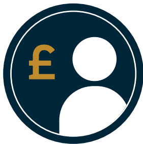
Funds transferred to you

Once the funds have been received on the day of completion, your Conveyancer will pay off any existing mortgages on your property and pay your Estate Agent. Your Conveyancer's bill will be settled and the balance of the sale proceeds will then be sent to you. If you are buying another property, this will form part or all of the purchase money for your new property. You will be sent a final detailed statement in relation to your sale, known as a completion statement.